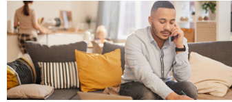
Remote workers and learners