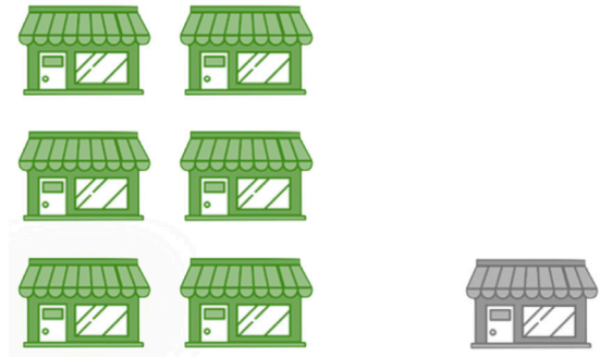
SIX MERAKI STORES CAN BE BROUGHT LIVE FOR THE COST OF ONE STORE COMPARED TO PREVIOUS NETWORKING TECHNOLOGIES

When totalling not just the cost of the physical equipment and licensing for Meraki, but also the full cost of time and resources dedicated to deploying and managing over 1,200 stores, Victra realized a savings of over 80% over 3-years. Table 6 shows the per store comparison of total ownership costs associated with Meraki versus the previous networking solution.